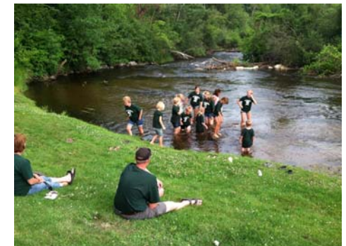
Chippewa River Fun

Swift Falls County Park is open for camping mid-May to mid-October. Only those with camping permits may remain in the Park after 10:00 p.m.